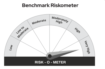
Nifty 500 TRI: Very High Risk